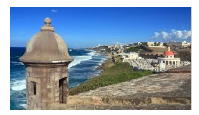
San Juan, Puerto Rico

On the negative side, within the last couple of weeks, all three major credit rating agencies downgraded Puerto Rico's debt to junk status. Puerto Rico's approximately $70 billion in bonds outstanding is an amount approaching the size of its entire economy. It's debt to GDP ratio is 84%, and if its $30 billion in unfunded pension liability is factored in, the ratio is 140%. The island has been in recession for ten years and its economy continues to weaken. The official unemployment rate is nearly 15% and the crime rate is staggering. Puerto Rico's poverty rate is 45% and its population of 3.6 million is trending lower as citizens leave the island in search of work. While the governor and current administration are making a valiant effort to balance the budget and grow the economy, the situation seems extremely challenging at best.